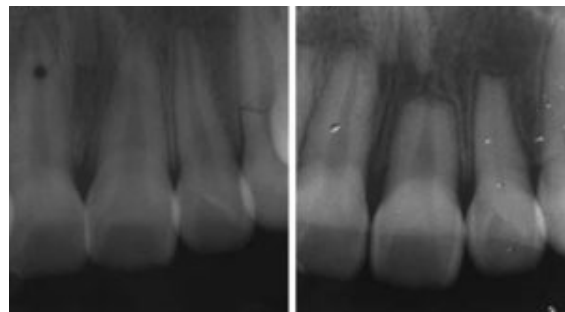
X-rays showing normal roots prior to treatment (left hand side) and shortened roots after treatment (right hand side)